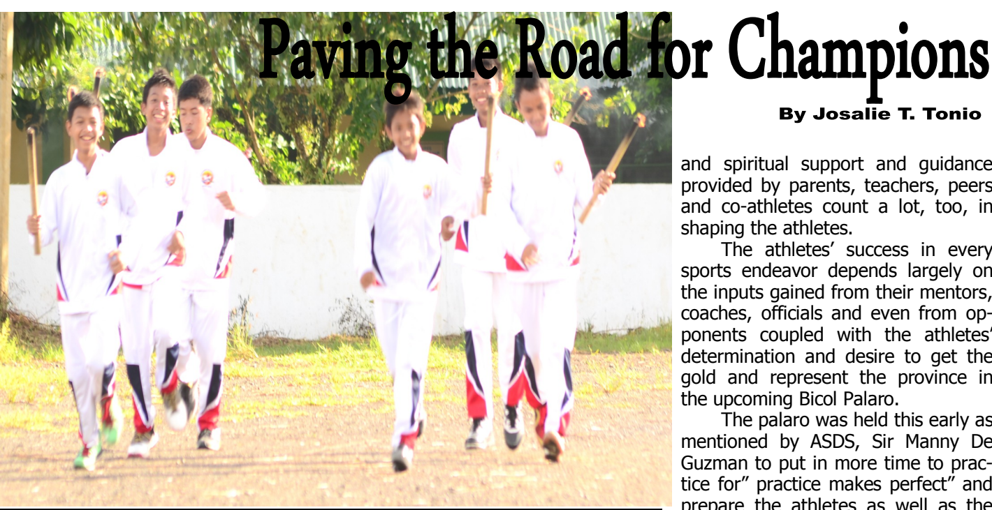
A NEW GENERATION OF CATANDUNGANON CHAMPIONS. The nucleus of the elementary basketball boys squad which represented Bicol in the 2013 Palarong Pambansa were given the honor of lighting the Friendship Flame at the start of the games.

The island province is wellknown for its hospitality. The hosting of the Palarong Bicol 2013 is a concrete proof as the sports spectators and enthusiasts have declared. Aside from being endowed with rich Godgiven resources, its people likewise proves its strength in terms of unity, resilience, hard work and a very strong faith in God.